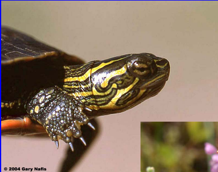
Western painted turtle